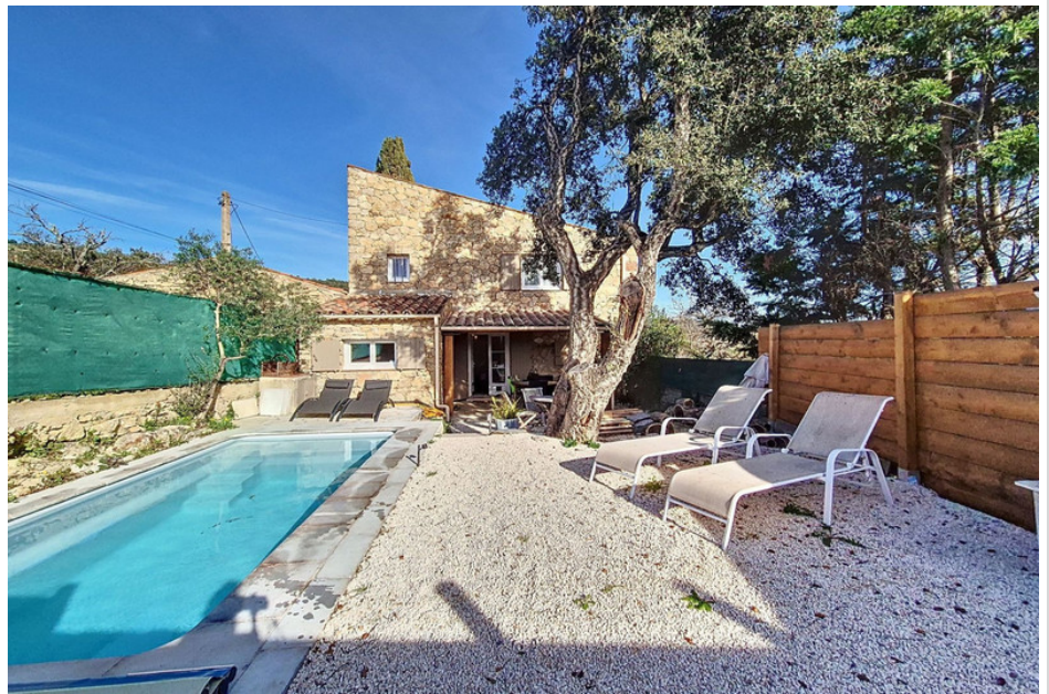
Village house 6016 Le Plan-de-la-Tour

Old sheepfold completely renovated of 90 m², with plot of land of 150 m² and its swimming pool, consisting on the ground floor, of a covered terrace, living room/lounge with fireplace and pellet stove, fitted kitchen. Upstairs, 2 bedrooms, each with its dressing room and one with mezzanine and small storage room, 1 bathroom. Very beautiful volumes, very pleasant outdoor space.